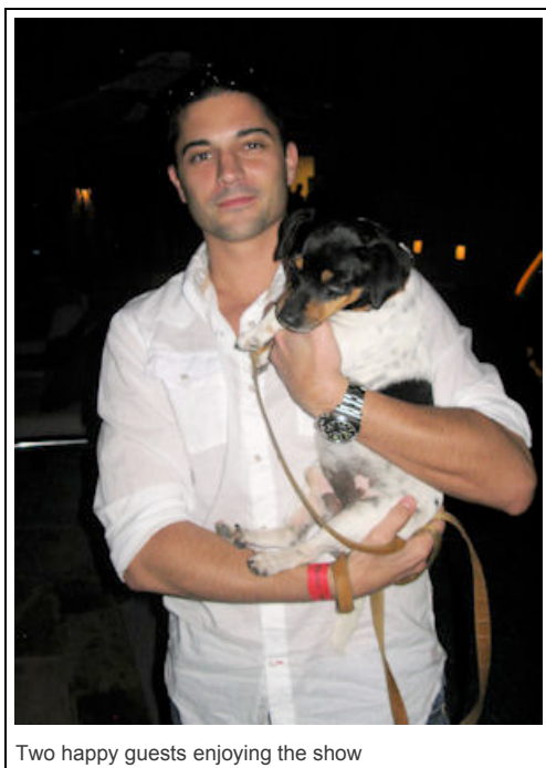
Two happy guests enjoying the show

Links Articles Contact Us About us Privacy Terms FAQ Invite a friend Bookmark